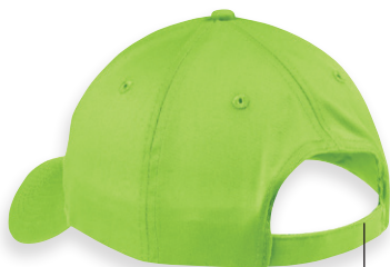
Adjustable hook and loop closure