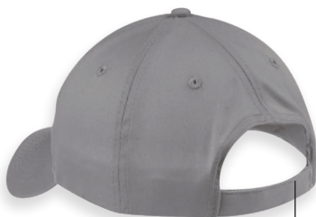
Adjustable hook and loop closure